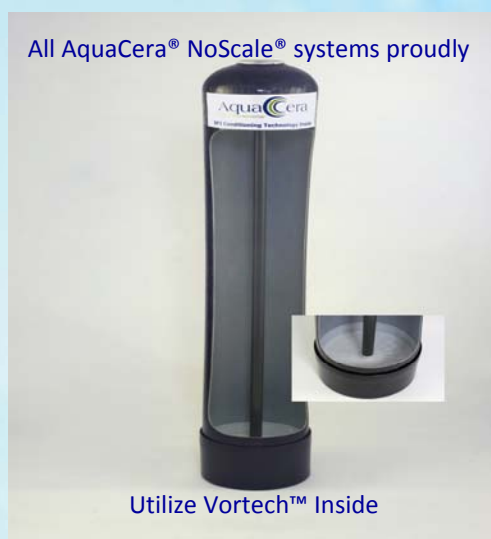
Utilize Vortech™ Inside